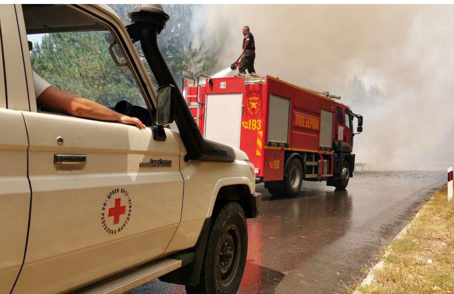
The Red Cross of the Republic of North Macedonia supported national response teams in fighting forest fires resulting from heat waves across the country.

The IFRC will support the Red Cross of the Republic of North Macedonia through participating in National Societies, IFRC Reference Centres, Hubs, and Labs. Through collaboration and knowledge sharing, the Red Cross of the Republic of North Macedonia can learn from the experiences and best practices of other National Societies. The IFRC's resource mobilization efforts also facilitate access to financial and material support for the National Society's programmes and initiatives. In line with the Integration and Inclusion Framework Plans developed by the National Society, the IFRC will provide guidance, technical expertise, and resources to support it in implementing inclusive programmes that promote protection and gender equality.