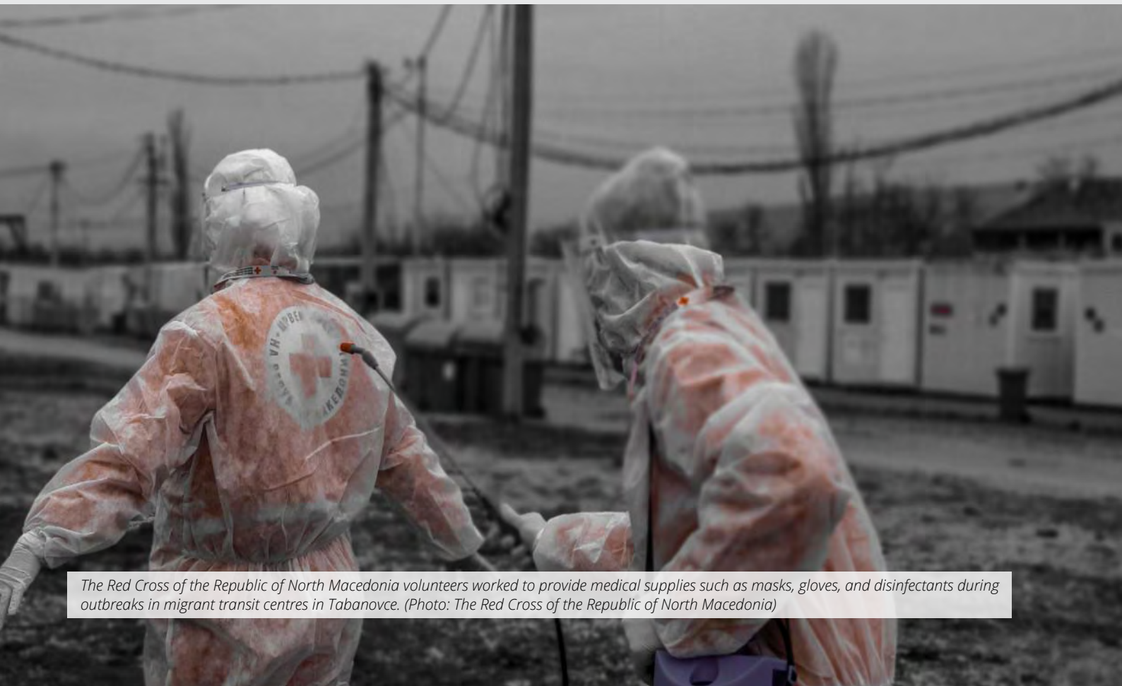
The Red Cross of the Republic of North Macedonia volunteers worked to provide medical supplies such as masks, gloves, and disinfectants during outbreaks in migrant transit centres in Tabanovce.

World Bank Population below poverty line 55%