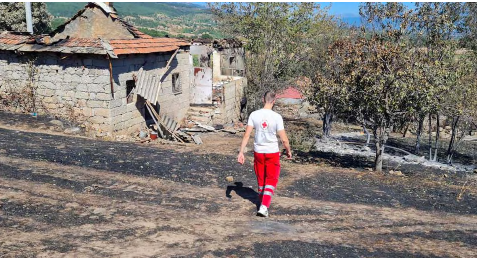
Through the provision of food and drinking water to affected people as well as firefighting brigades, the Red Cross of the Republic of North Macedonia assisted national fire fighting efforts.

The Swiss Red Cross offers bilateral support to the Red Cross of the Republic of North Macedonia for capacity building, healthy and active ageing programmes, social services and caregiver training for older people and people with disabilities. Key initiatives include humanitarian aid and MHPSS for displaced people from Ukraine, referral services, CVA, child-friendly spaces and support for the Emergency Button service and homeless assistance.